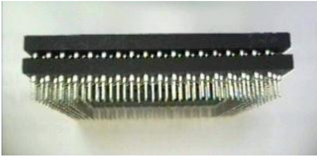
Figure 3 - Pentium® EBS add-in socket, showing