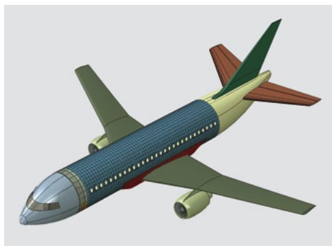
The performance, mesh editing, and selection improvements in Abaqus 6.10 make it easier to work on large models containing a mixture of geometric and orphan mesh components.